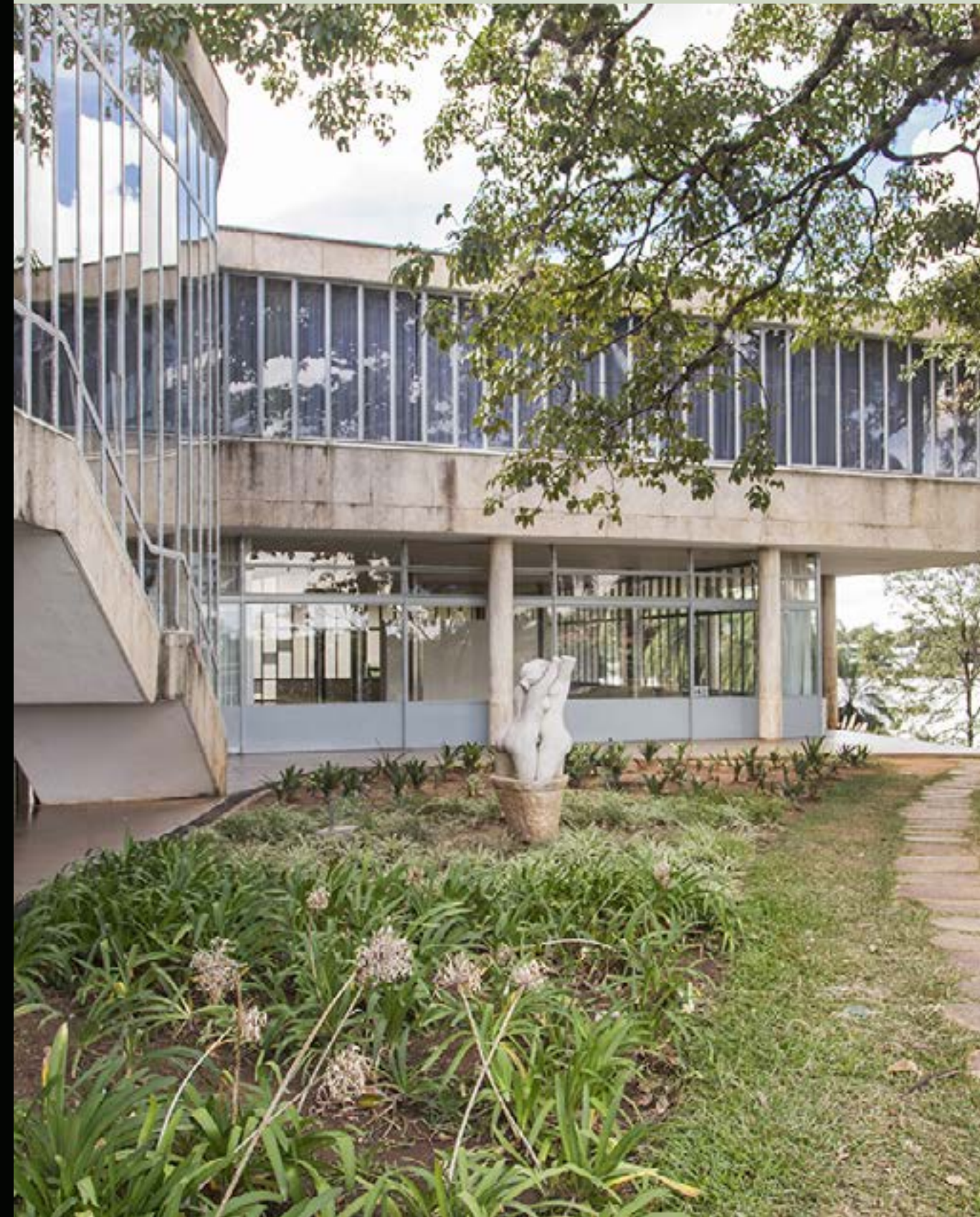
CASSINO / MUSEU