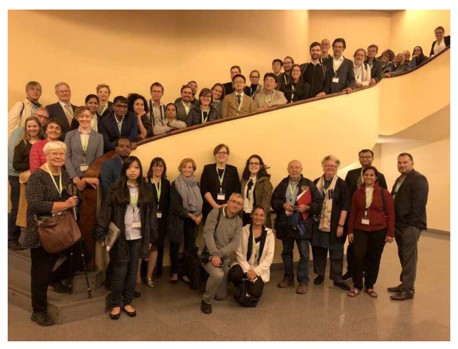
Sala Belli, Provincia Autonoma di Trento, Piazza Dante 15, Trento, ITALY